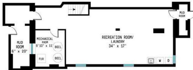
BASEMENT CEILING HEIGHT: 6'9" INT: 873 ft 2