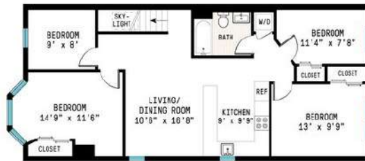
SECOND LEVEL CEILING HEIGHT: 9'6" INT: 915 ft 2